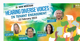
Hearing Diverse Voices in Tenant