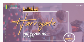
HDN Networking Mixer Harrogate