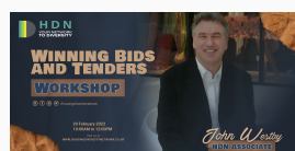
Winning Bids and Tenders Workshop